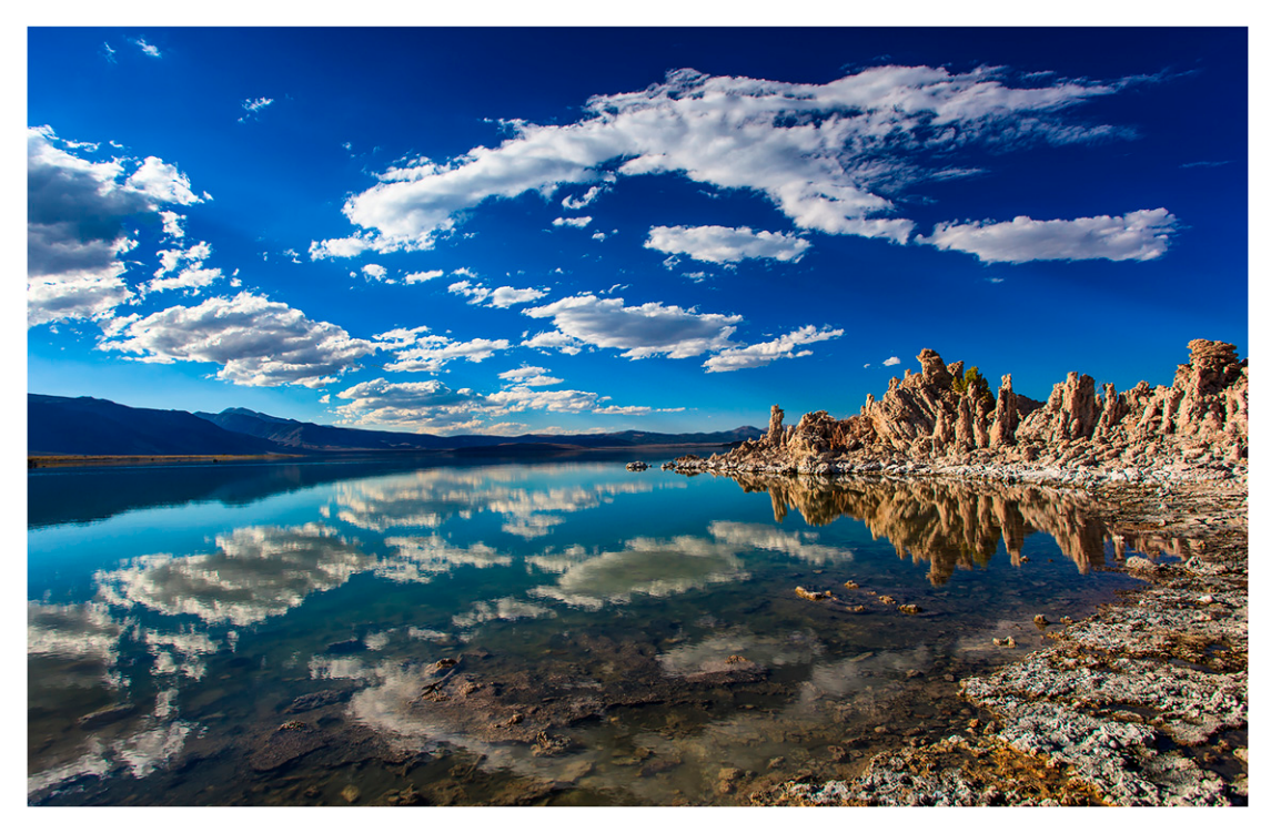
Natural lakes with relatively high concentrations of phosphorous compounds, such as Mono Lake in California, may have been commonplace in the prebiotic Earth, providing the phosphorus-rich environments for biology and life to take hold.

Some of the earliest insights into life's origins came from the classic experiments conducted by Stanley